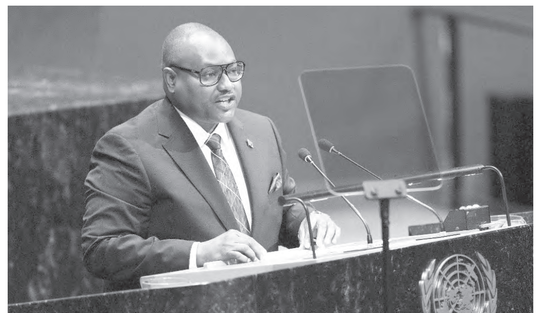
Mulambo Hamakuni Haimbe, Minister for Foreign Affairs of Zambia, at the 80th session of the United Nations General Assembly, Monday, Sept. 29, 2025.

The U.S. approach replaces decades of engagement anchored in the now-dismantled United States Agency for International Development and the President's Emergency Plan for AIDS Relief, or PEPFAR.