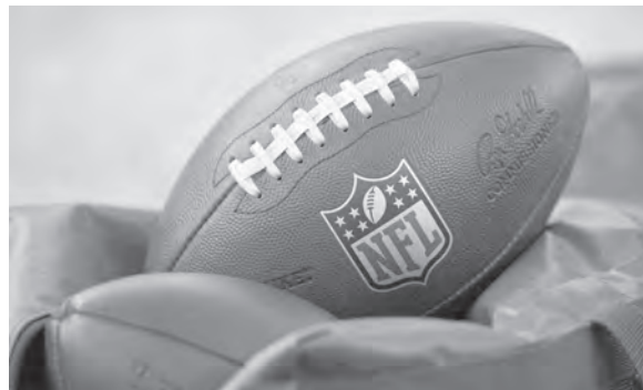
Footballs at the NFL football game between the Philadelphia Eagles and the Washington Commanders on Jan. 4, 2026, in Philadelphia.