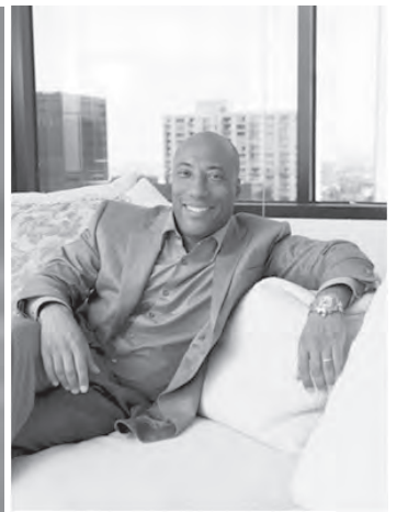
Byron Allen via allenmedia.tv